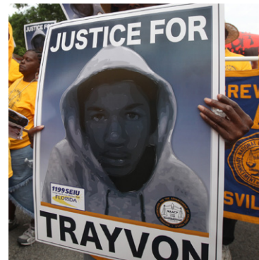
(HEATHER HEYER), (TRAYVON MARTIN)