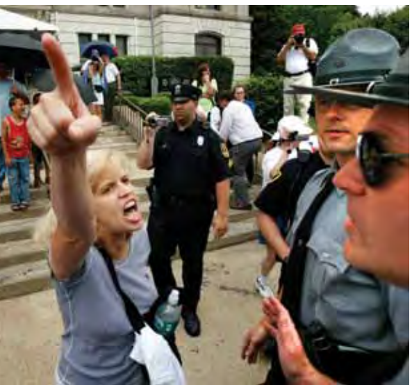
(VIGIL) (PROTESTER)