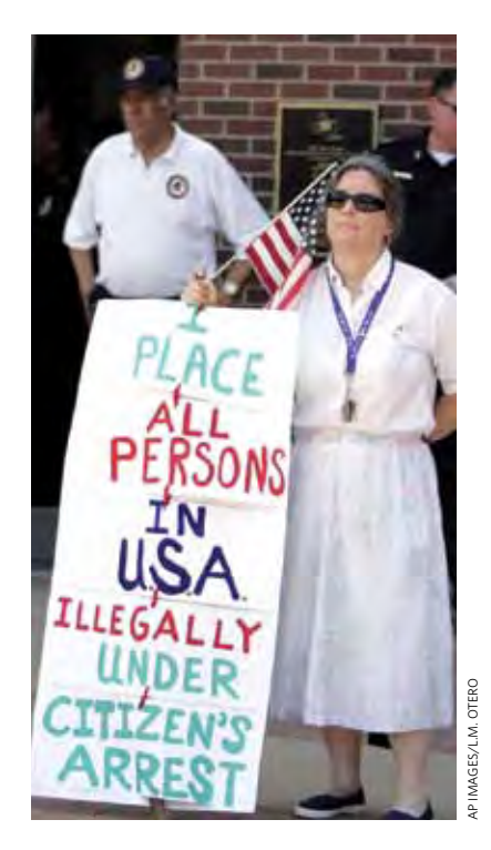
Protestor at Farmers Branch City Hall in August 2006

Nov. 13, 2006 The Farmers Branch City Council unanimously adopts an ordinance requiring renters to provide proof of citizenship or legal residency and fining landlords who rent to undocumented immigrants.