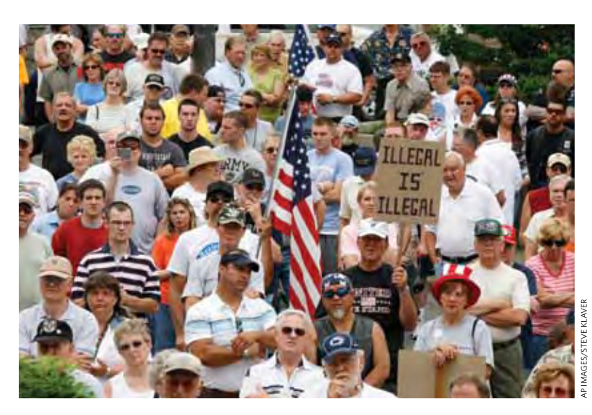
Supporters of Hazleton Mayor Lou Barletta and his anti-immigrant legislation gathered before City Hall in June 2007.

July 26, 2007 After 9-day bench trial, the judge strikes down both ordinances, writing, "Hazleton, in its zeal to control the presence of a