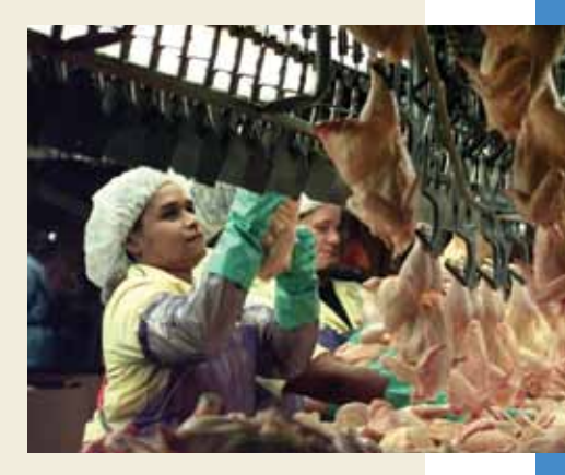
Poultry processing is one of the most dangerous occupations in America, killing 100 workers and injuring 300,000 each year.

"He pressed down on the latch and I felt how the bones cracked apart," she recalls. Her hand went limp with pain, but the supervisor yelled at Sara to get back to work. "I