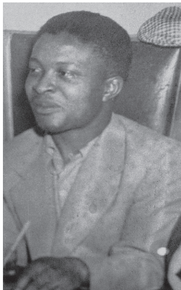
Viola Gregg Liuzzo (left) and Wharlest Jackson (right) pictured here are among those honored at the Civil Rights Memorial Center.