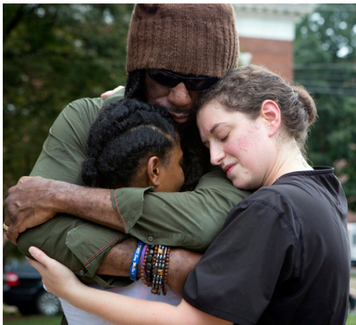
Community members holding space and creating authentic dialogue.

Interrogate the idea of safe space. All too often, before uncomfortable conversations even begin, some white people will request that the conversation feel “safe” and that everyone should “assume best intentions.” The result of these requests is that Black, Indigenous, and People of Color (BIPOC) feel silenced before the conversation even begins. Ask two key questions when the need for “safe space” comes up: What does “safety” mean when talking about race?