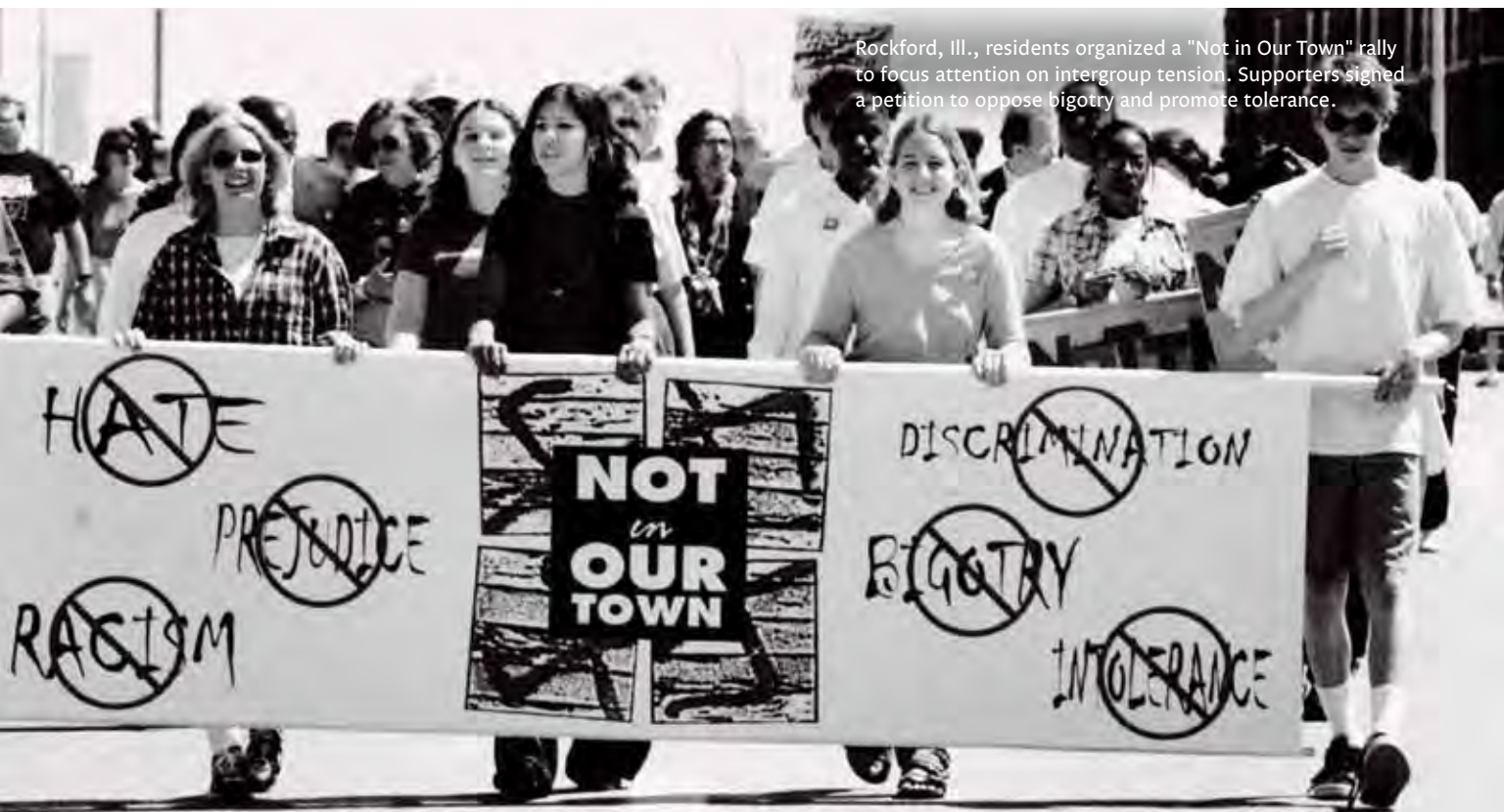
Rockford, Ill., residents organized a “Not in Our Town” rally to focus attention on intergroup tension. Supporters signed a petition to oppose bigotry and promote tolerance.

“The story of Billings embodies how people believe the world ought to be,” she said. “It touches on First Amendment responsibilities (and) civic responsibility; it’s about multiple faiths finding ways to validate each others’ liberties and freedoms. It’s a transformation of violence and hate into peace-making.”