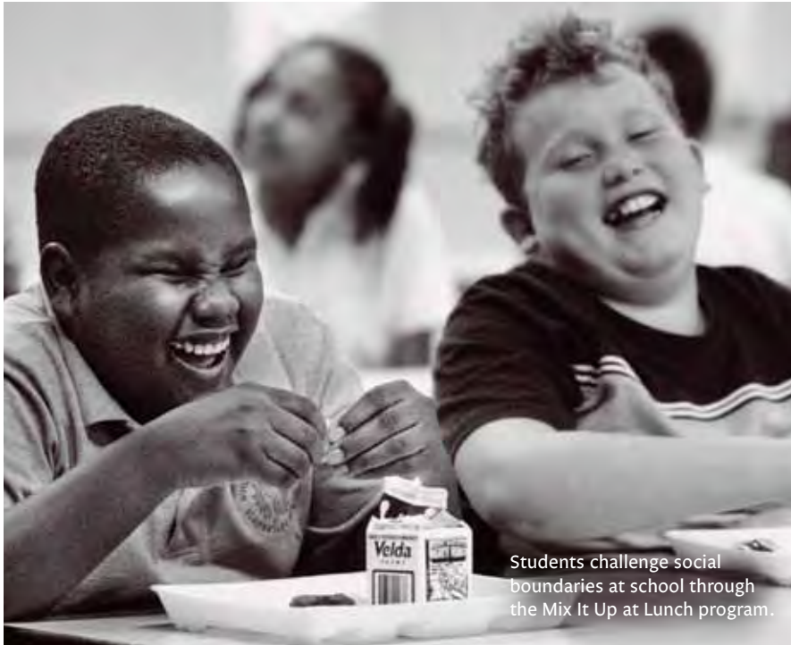
Students challenge social boundaries at school through the Mix It Up at Lunch program.

Promote tolerance and address bias before another hate crime can occur. Expand your community's comfort zones so you can learn and live together.