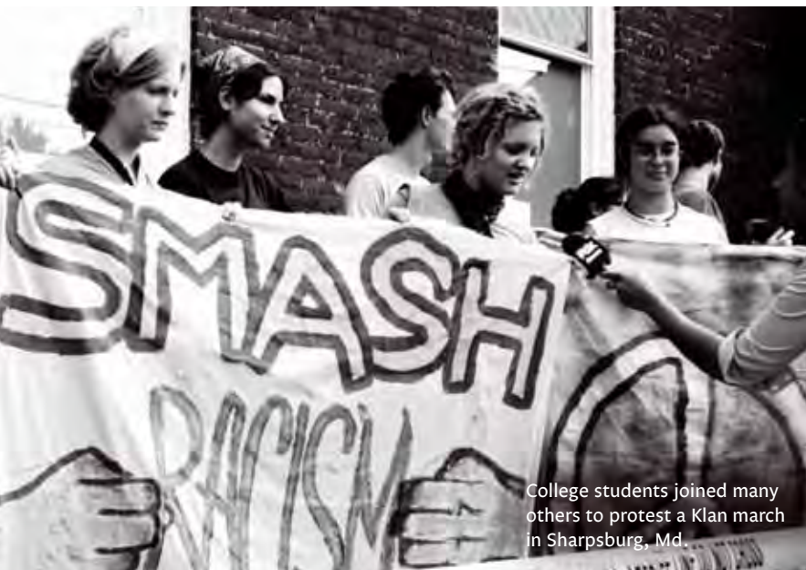
College students joined many others to protest a Klan march in Sharpsburg, Md.

>> Do not debate white supremacists or other