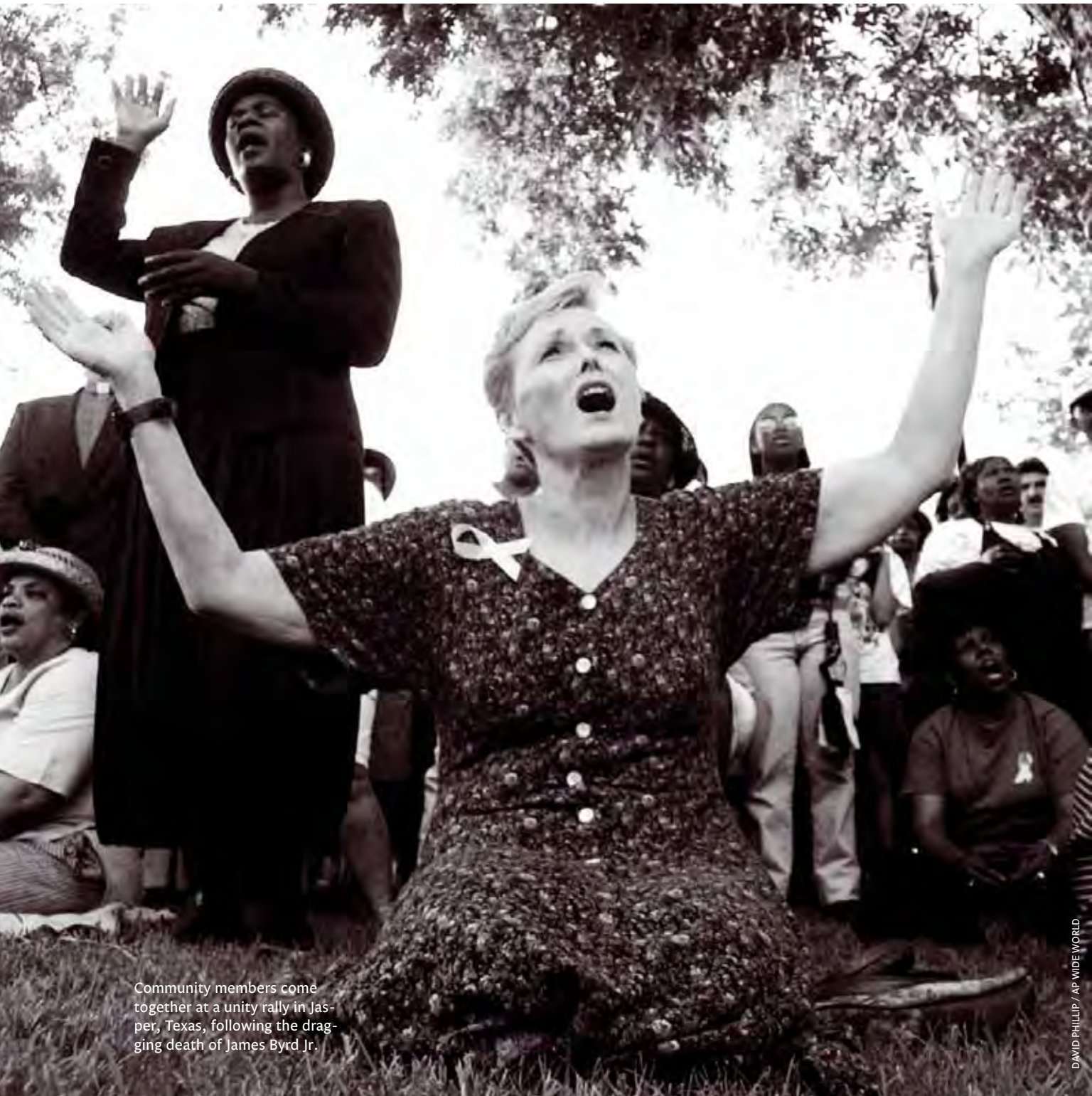
Community members come together at a unity rally in Jasper, Texas, following the dragging death of James Byrd Jr.