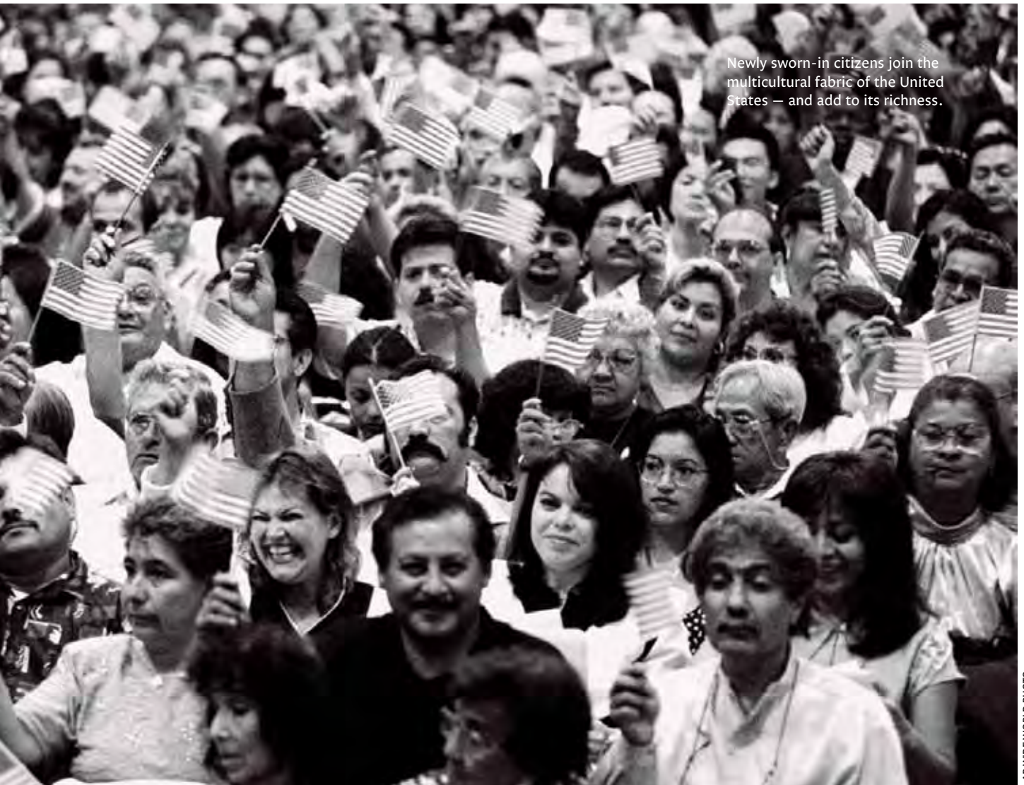
Newly sworn-in citizens join the multicultural fabric of the United States — and add to its richness.