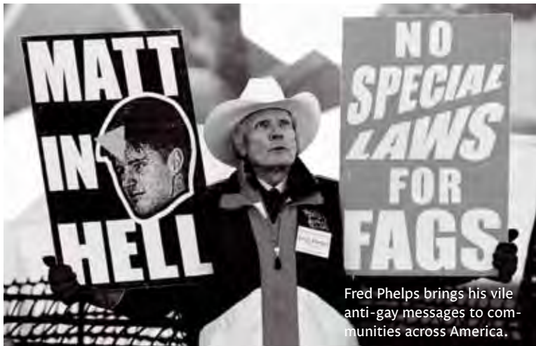
Fred Phelps brings his vile anti-gay messages to communities across America.