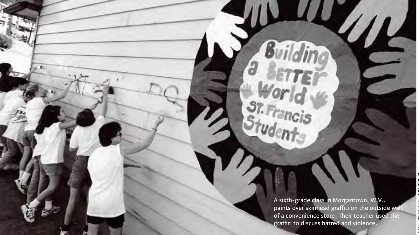
A sixth-grade class in Morgantown, W.V., paints over skinhead graffiti on the outside wall of a convenience store. Their teacher used the graffiti to discuss hatred and violence.