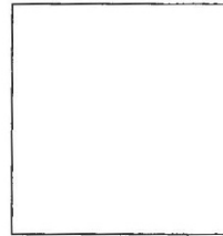
Right index fingerprint of alien removed

(Signature of alien being fingerprinted)