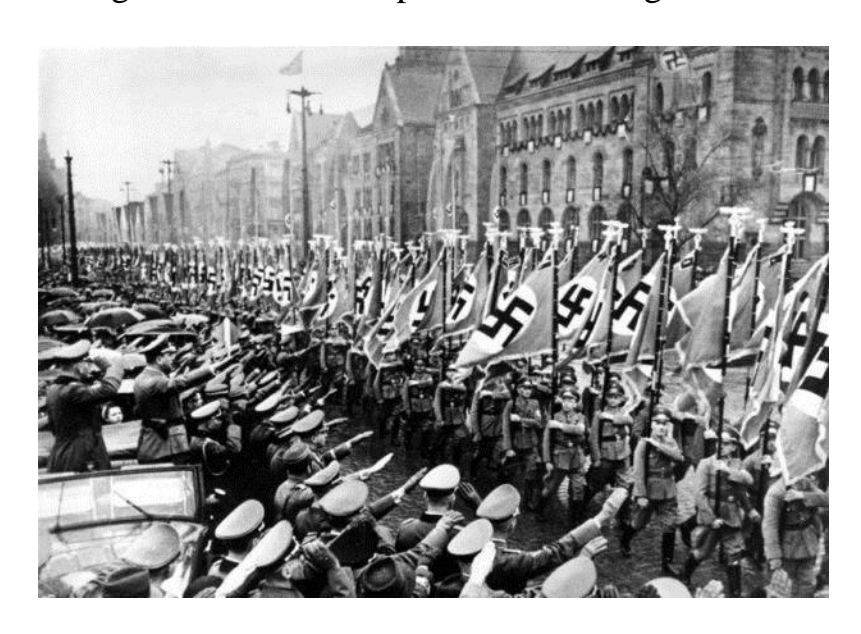
January 10, 2017 Articles

176. Mr. Anglin concluded the post with an image of Nazis marching: