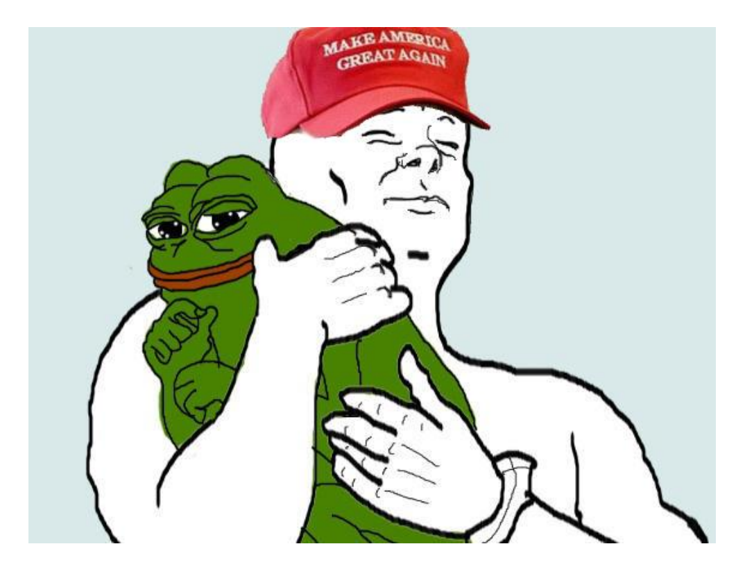
January 8, 2017 Articles

168. The article opened with an image of Donald Trump hugging Pepe the frog, an alt-right meme: