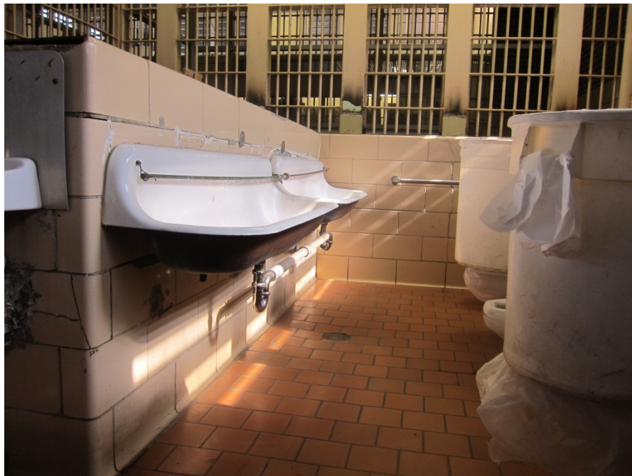
(Kilby Dormitory A bathroom, showing garbage can on top of accessible toilet)

335. At the Fountain chapel, the only bathroom for prisoners has a very narrow door that a person in a wheelchair would not be able to go through.