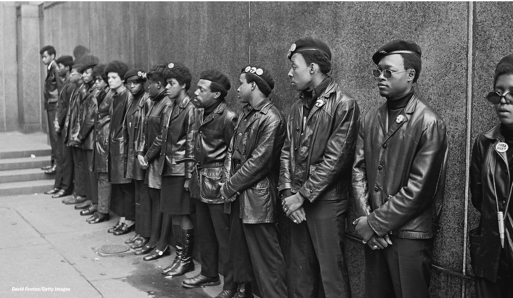
David Fenton/Getty Images