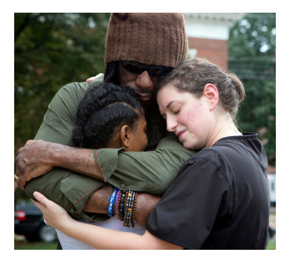
Community members holding space and creating authentic dialogue.

Move from the concept of "safe space" to the idea of "brave space." Brave space recognizes that we all have hurt others, and we all have hurts, different as they may be; it allows us to connect in deeper and more nuanced ways. Brave space enables us to drop the false notion of "safety" altogether since it isn't realistic in the first place. Brave space asks all of us to not look for the silver lining and feel the need to keep things posi-