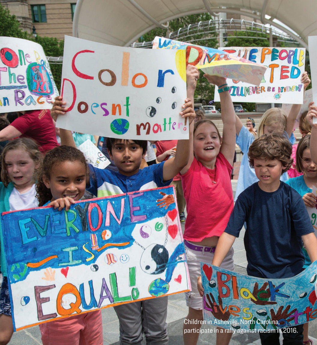
Children in Asheville, North Carolina, participate in a rally against racism in 2016.

with hate experts like the Southern Poverty Law Center. Urge editorial writers and columnists to take a stand against hate.