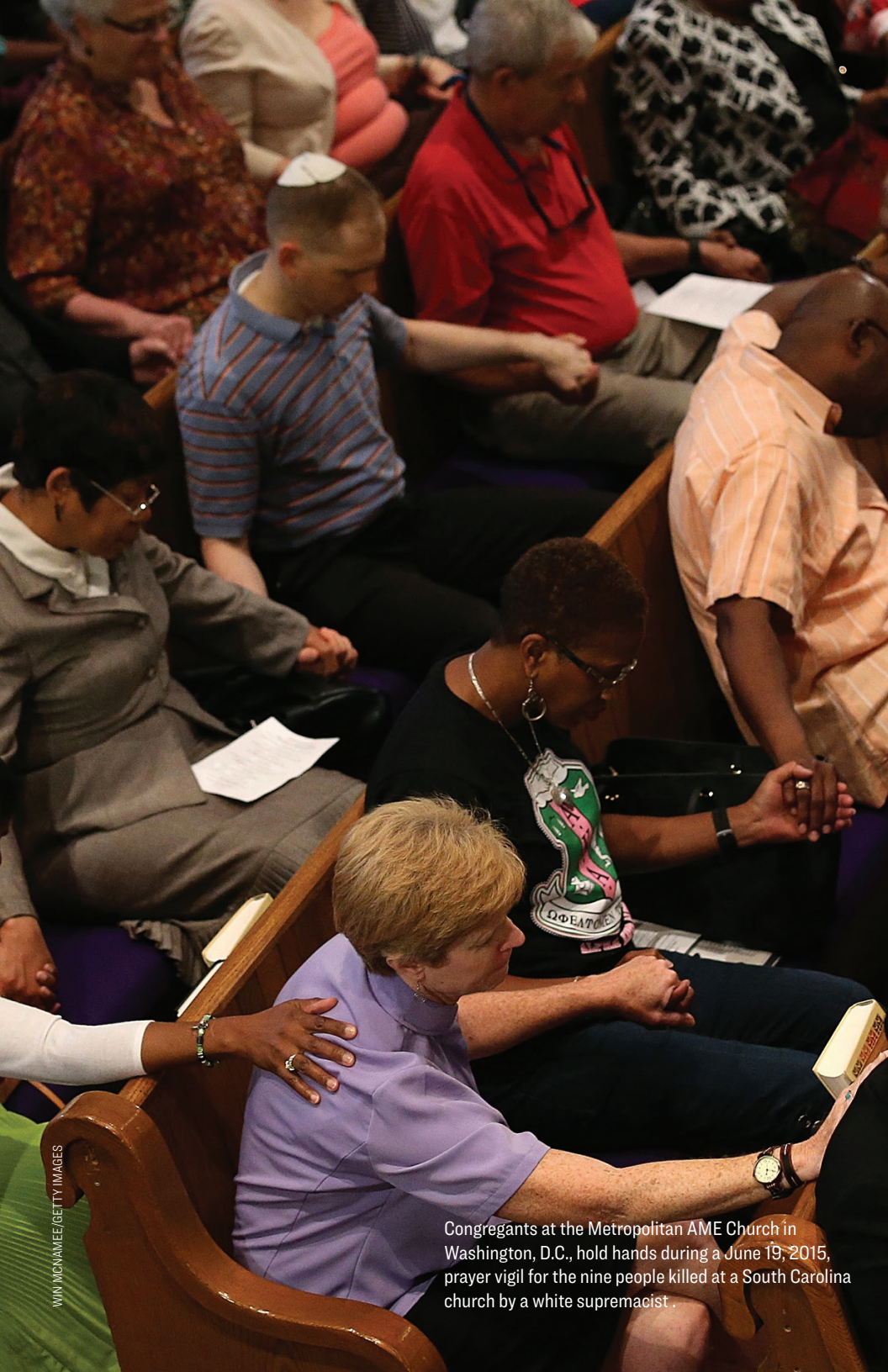
Congregants at the Metropolitan AME Church in Washington, D.C., hold hands during a June 19, 2015, prayer vigil for the nine people killed at a South Carolina church by a white supremacist.