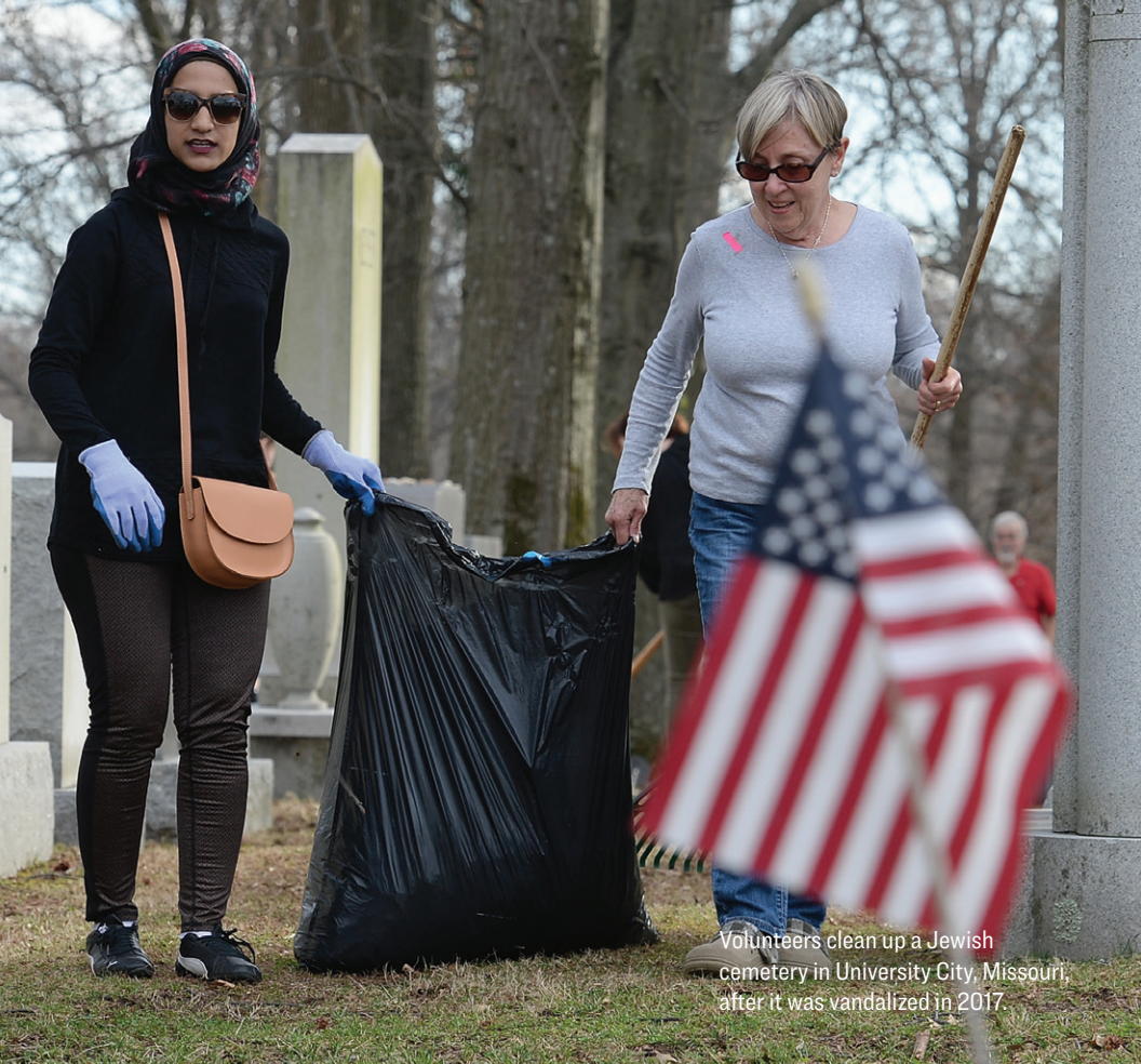
Volunteers clean up a Jewish cemetery in University City, Missouri, after it was vandalized in 2017