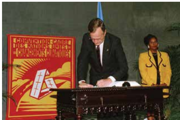
President George H. W. Bush signs a United Nations accord on climate change in 1992.

Agenda 21 is not a treaty. It is not a legally binding document. Even its recommendations do not come from the top down, but are meant to encourage local