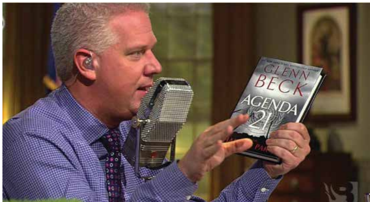
Political provocateur Glenn Beck may have done more than anyone to spread false conspiracy theories about Agenda 21, which he describes as part of a globalist plot to “suck all the blood” out of American communities.