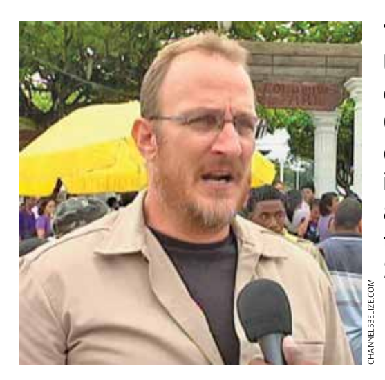
The case brought by Orozco and UNIBAM is "an orchestrated plan of demonic darkness to dethrone God from our constitution and open massive gateways to demonic influences and destruction that will affect generation after generation to come." Scott Stirm