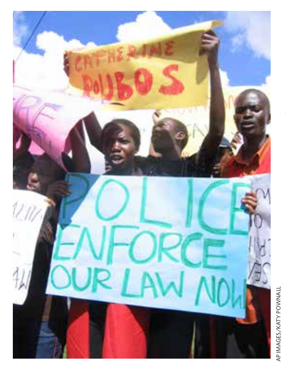
Belize is a hotbed of anti-gay hatred, partly the result of propaganda spread with the help of U.S.-based Christian Right groups.

Though the group's role in Belize is absent from its website, the ADF, like many prominent American religious-right groups, has supported criminalization in the past in this country. In the 2003 Lawrence v. Texas case, the ADF submitted an amicus brief supporting the