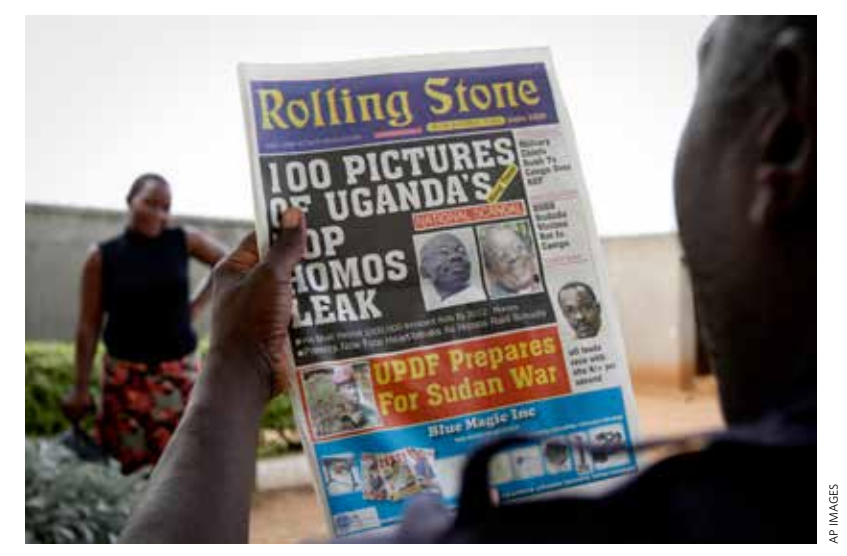
In Uganda, the Rolling Stone newspaper published the names, addresses and photos of 100 gay men in 2010 with a bright yellow banner that read "Hang Them." Twenty-three days later, an LGBT activist on the list was murdered in his home.