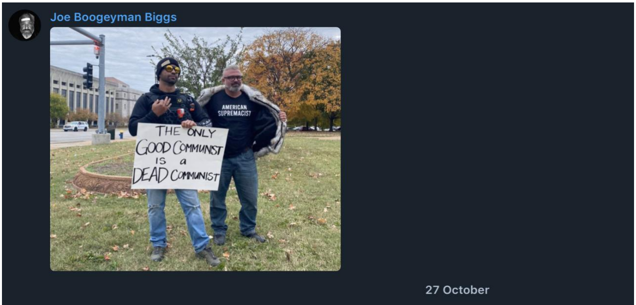
An image of Enrique Tarrio and Joe Biggs, posted to Joe Biggs' Telegram channel, October 2020.