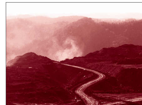
Mountaintop removal coal mining.

The EROEI of fossil fuels is in gradual, but terminal, decline. Without a doubt, a day is approaching when oil, gas and coal will supply no more than a small fraction of our energy needs at most, but not because they are all used up. That day will come when the EROEI drops to a certain threshold, below which it will no longer behoove us