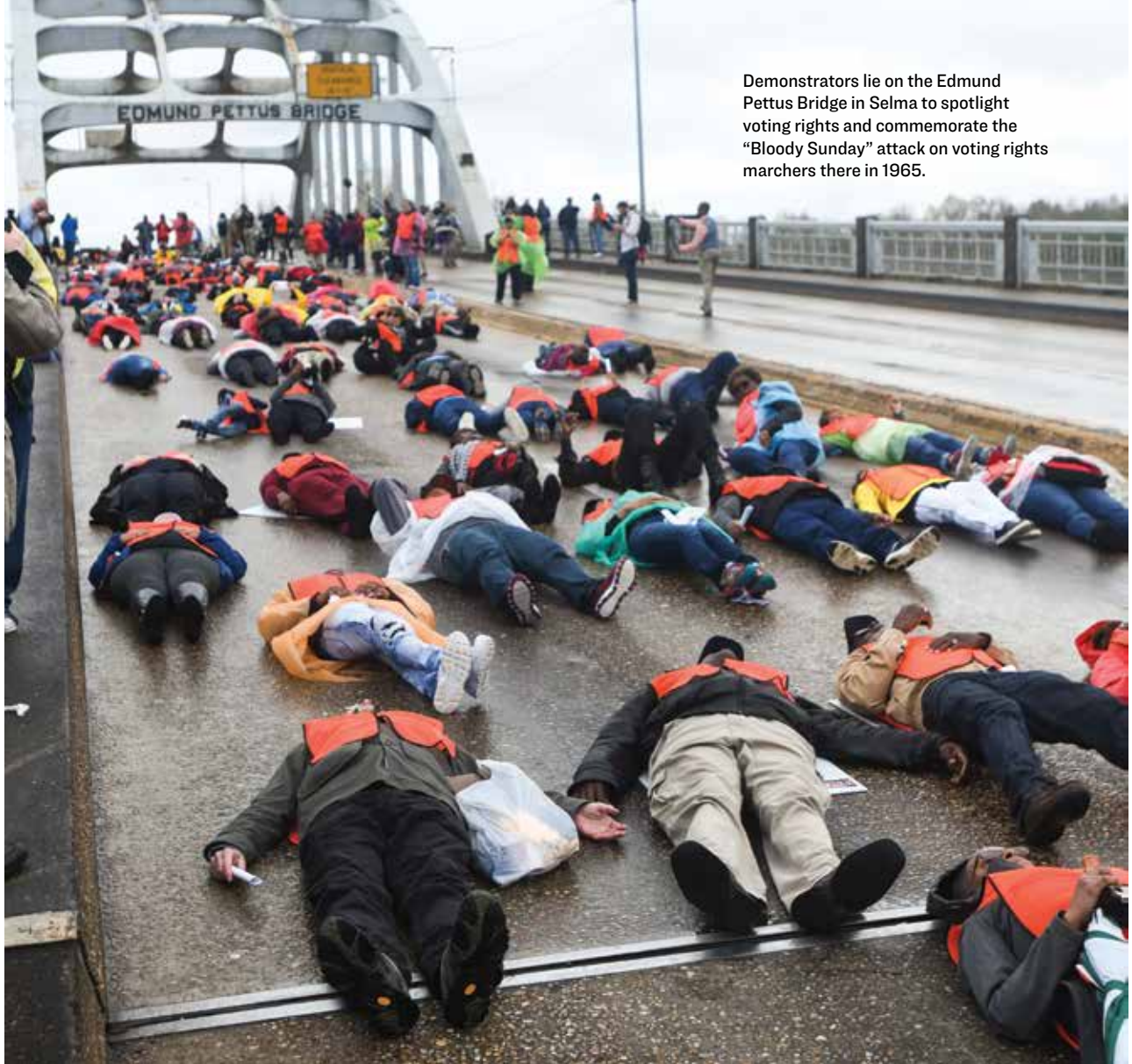
Demonstrators lie on the Edmund Pettus Bridge in Selma to spotlight voting rights and commemorate the “Bloody Sunday” attack on voting rights marchers there in 1965.

guidelines on how to fairly maintain the voter file. It prevents states from removing voters from the rolls unless they fail to respond to a mailed card inquiring about a change of address and do not vote in two general election cycles following failure to respond to the mailed card. 98 The act also forbids states from removing anyone from the voter file within 90 days of a federal election. Though these protections help prevent states from cancelling legitimate voter registrations, they have not proven sufficient in Alabama and many other states.