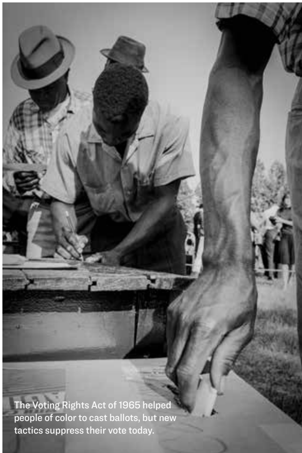
The Voting Rights Act of 1965 helped people of color to cast ballots, but new tactics suppress their vote today.

identification requirements, move and shutter polling places, purge millions of voter registrations, and more.