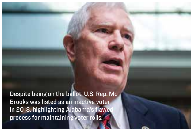
Despite being on the ballot, U.S. Rep. Mo Brooks was listed as an inactive voter in 2018, highlighting Alabama's flawed process for maintaining voter rolls.

The National Voter Registration Act requires voter roll maintenance, but unfortunately, the methods used