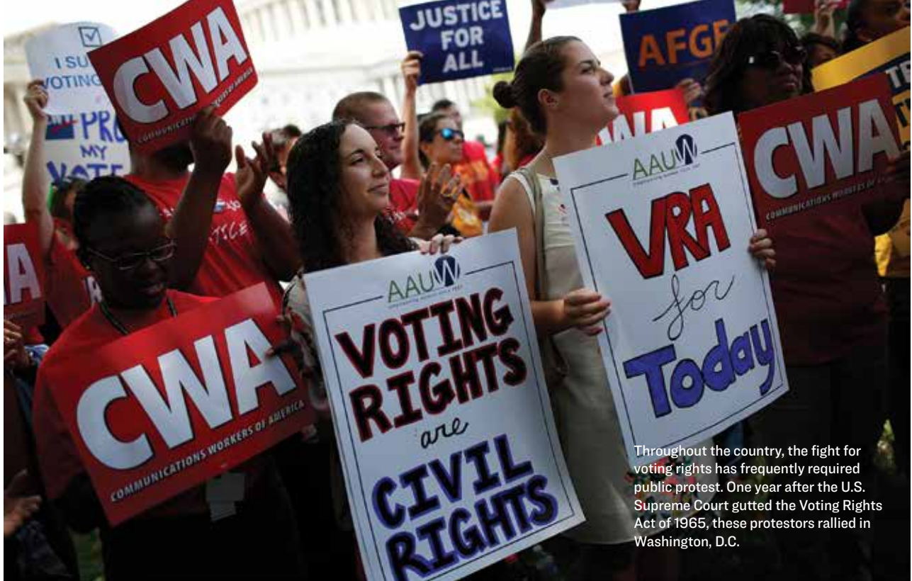
Throughout the country, the fight for voting rights has frequently required public protest. One year after the U.S. Supreme Court gutted the Voting Rights Act of 1965, these protestors rallied in Washington, D.C.