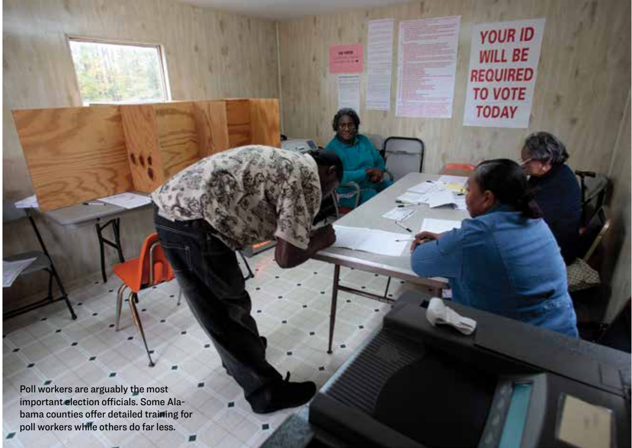
Poll workers are arguably the most important election officials. Some Alabama counties offer detailed training for poll workers while others do far less.

They are also responsible for removing voters who are no longer qualified to vote because they moved, died, or were convicted of a disqualifying crime.